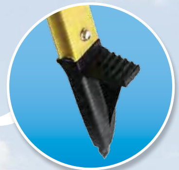
Heavy duty tripod shoe and replaceable points